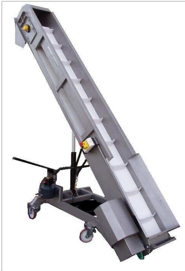
Delta TR 300