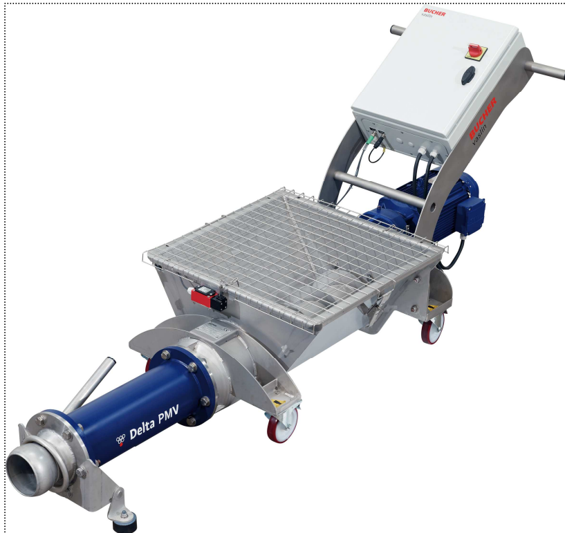
Delta PMV 2

In the heart of the vinification process, the Delta PMV pumps receive the fresh grapes and are adapted to the transfer of fermented pomace (except for Delta PMV1).